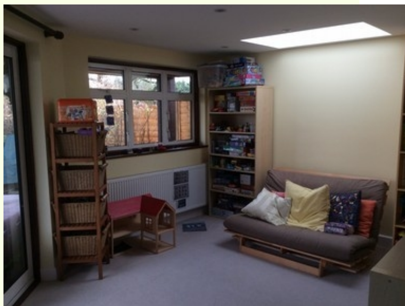
Lounge playroom above