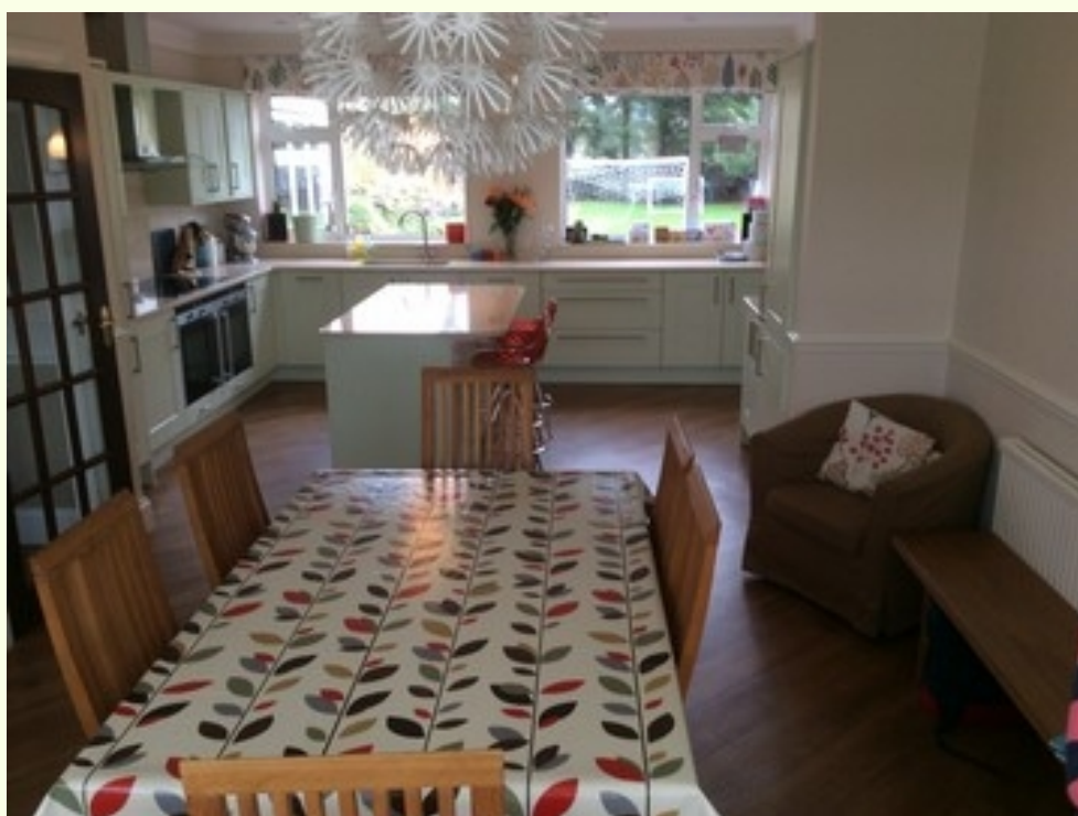
Kitchen/ diner below