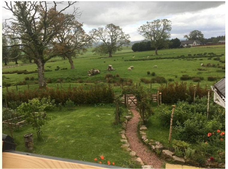
front garden and view