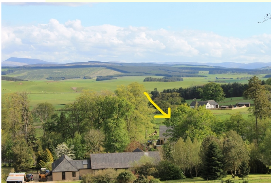
location of the house from above,

http://www.all4kidsuk.com/category/kids-days-out/south-lanarkshire