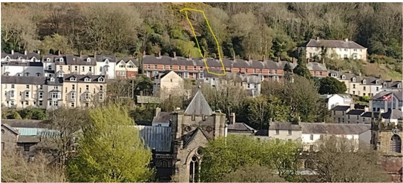
The yellow rectangle identifies the location of this home.