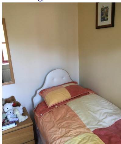
Bedrooms, and garden right Below are views from the nearby the house.