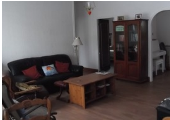
(More photos below)

This home is a first floor flat with an exterior staircase. There is a small private garden with a lawn and patio area. There are balconies at the front and the rear, which has a lovely view, see photo below. There is a garden table & chairs and a small snooker table available for use in the basement. The garden is accessed via the garage, which also has bikes available to borrow. House-swappers will be pleased to know that just 15 minutes walk away are some Christian friends who are very helpful, and will be happy to practice speaking English!