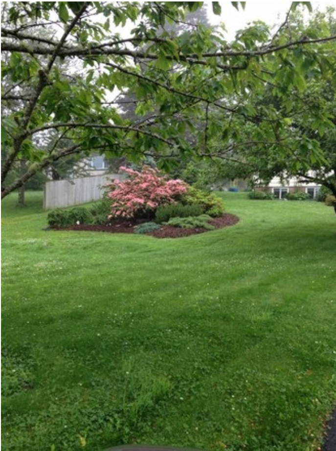
spacious back garden