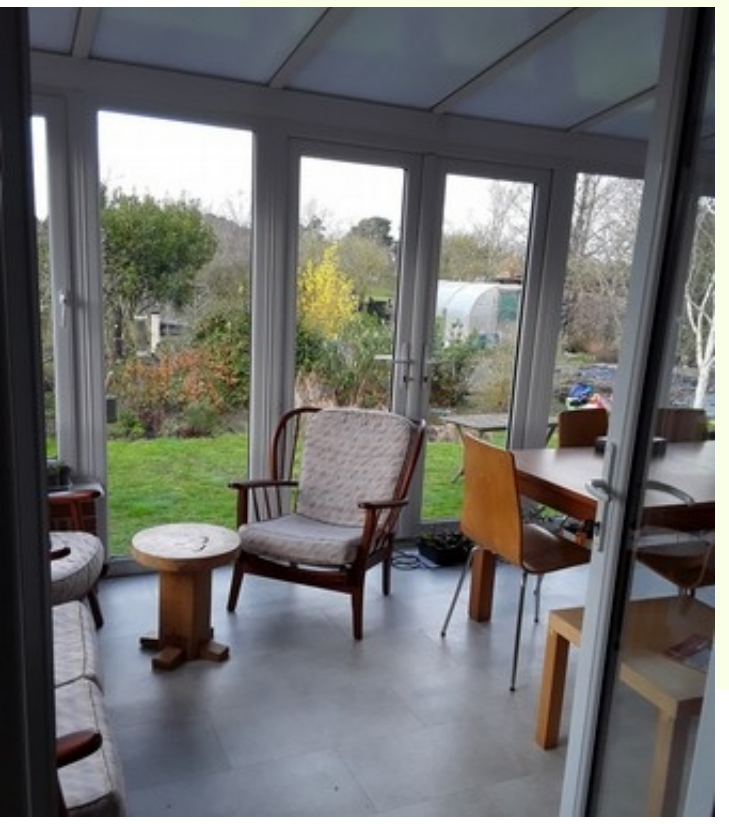
Spring 2025; from Peter and Paula in Lincs 1728 A wonderful rural location. Very tidy bungalow with gorgeous 'natural' garden.