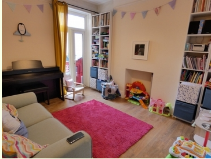
More photos below